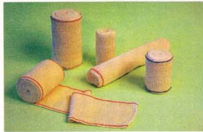
Elastic Bandage Crepe