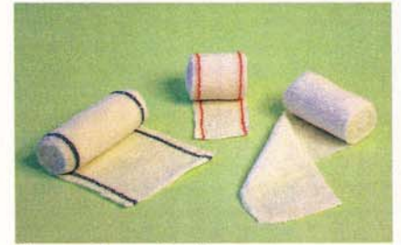
Cotton Crepe Bandage