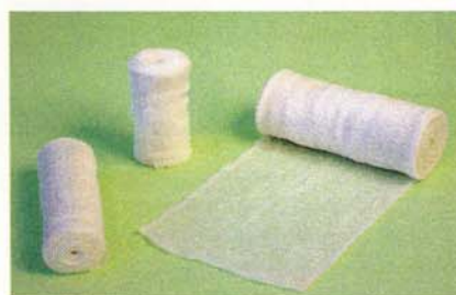
Gauze Bandage With Woven Edge