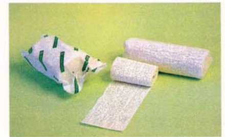
Plaster of Paris Bandage (P.O.P)