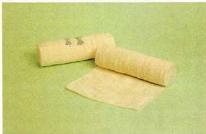
Elastic Bandage Plain