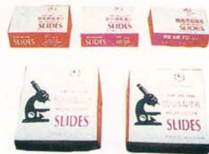
Cover Glass & Microscope Slide